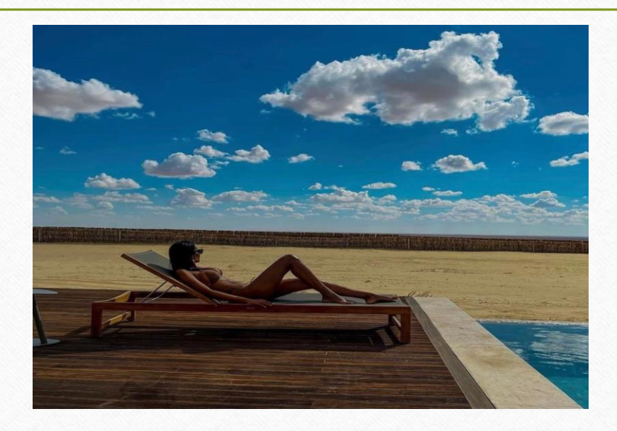
Enjoying nice weather, sunbathing