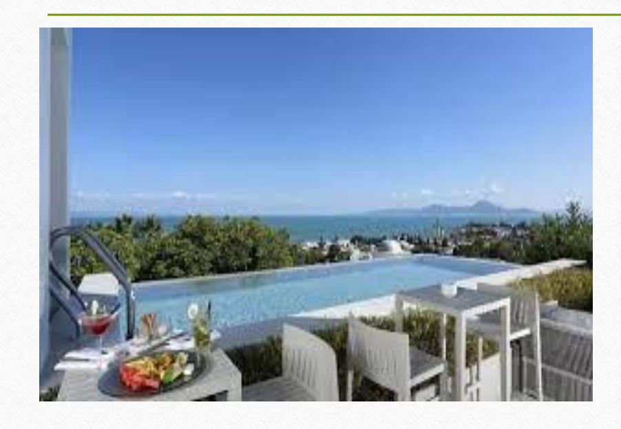
Restaurants with view