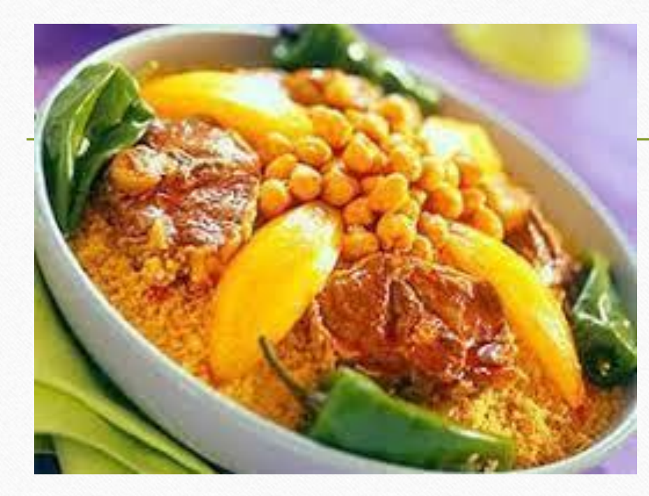
Trying Couscous and other Tunisian meals