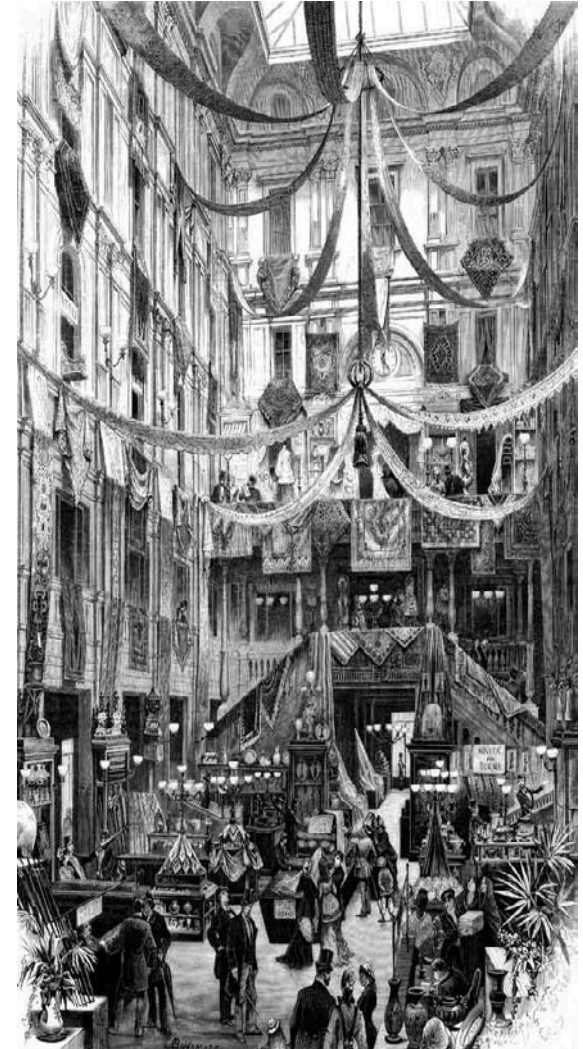
Magazzini "La Rinascente"

Università Commerciale L. Bocconi, founded in 1902 by the businessman Ferdinando Bocconi, was the first Italian University to grant a degree in Economics .