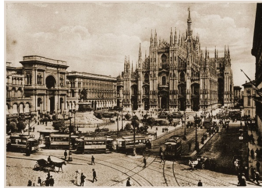
Milano Piazza Duomo - 1900