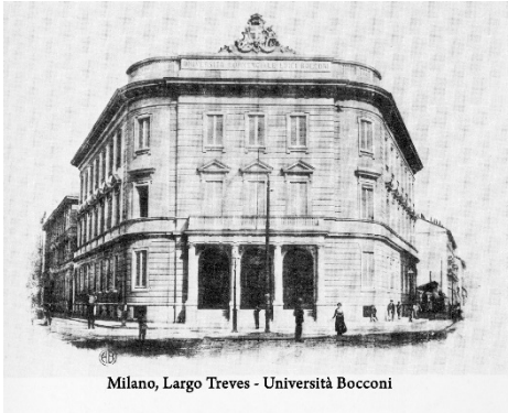
Bocconi in 1902